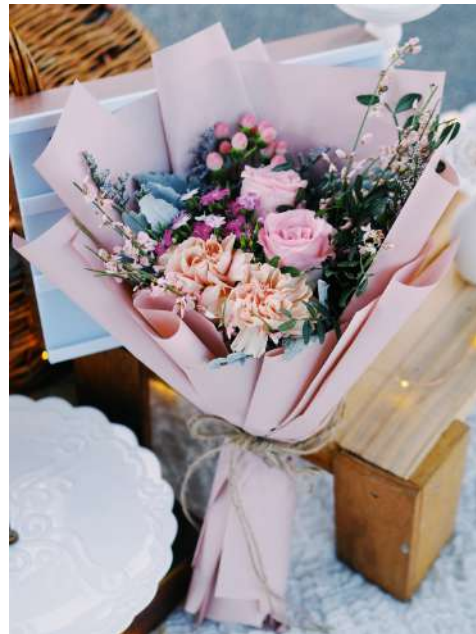
THE BLUSHING ONE

For a hassle-free experience, you do not get to choose a specific bouquet design/flower but may opt for either of these in the Booking Form!